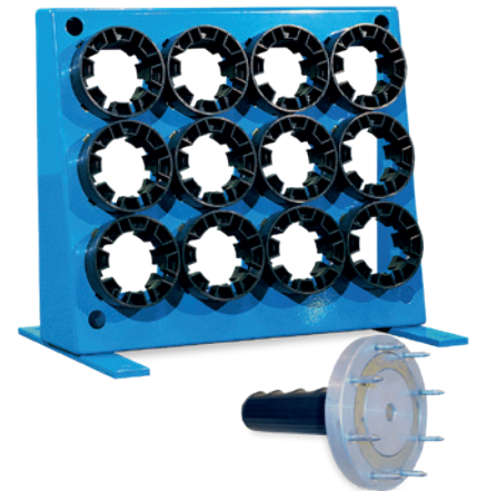
Tool base and Tool rack with QuickChange-tool as an option.