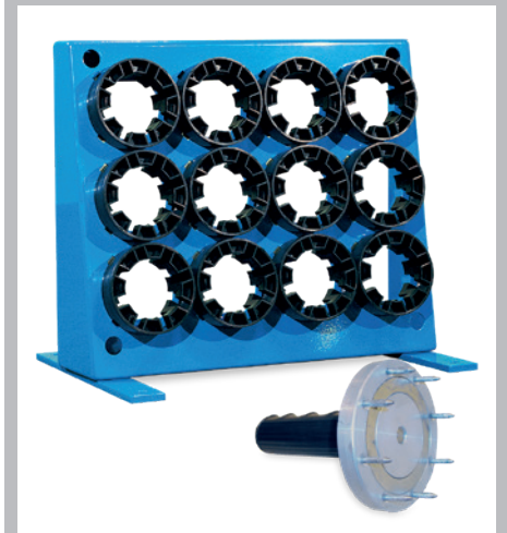
Tool base and Tool rack with QuickChange-tool as an option.