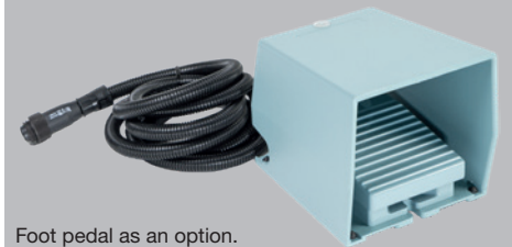
Foot pedal as an option.